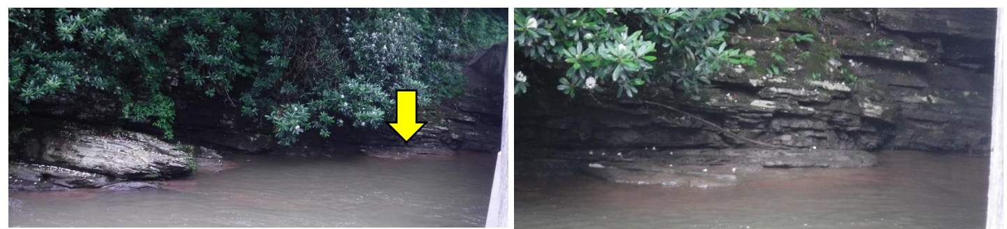
Left: The short cliff on the W shore of Glady Fork as viewed from the E end of the bridge on the upstream side. Note the exposed rock shelf on the right, the "rule-of-thumb" marker for S-N hikers. Right: Close-up of the "rule-of-thumb" marker for S-N hikers. At the level of jutting rock shelf exposure shown, the downstream washout was passable with ease on July 14, 2019.