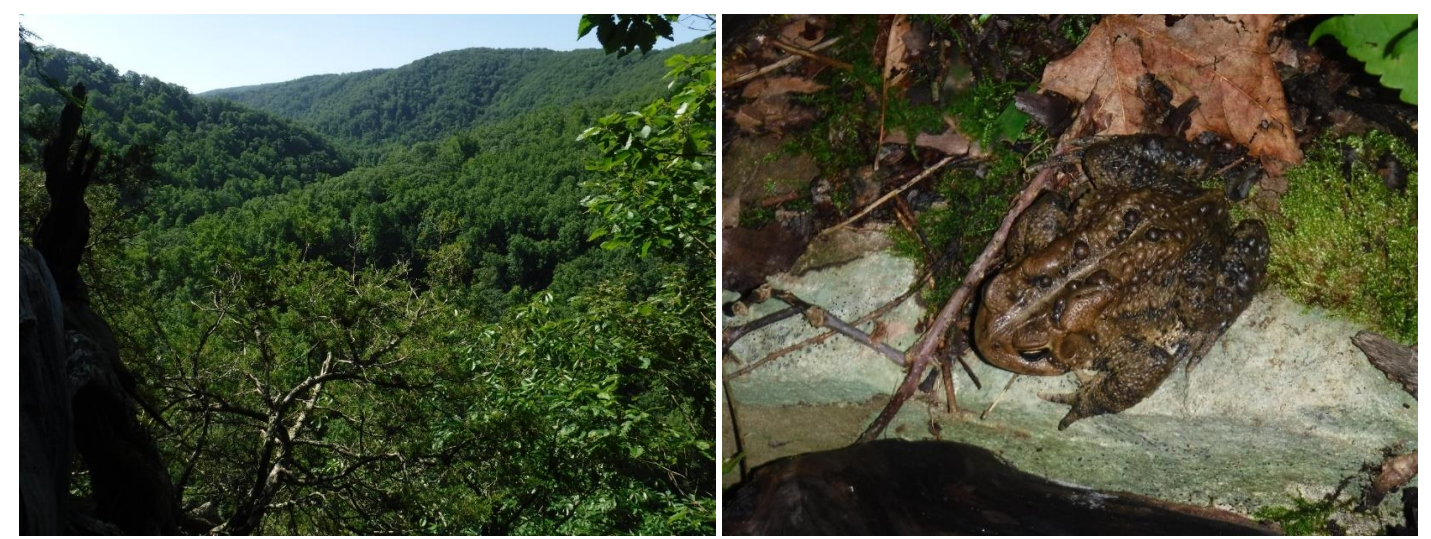
Left: A view from the Shirk clifftop overlooking the beautiful Glady Fork valley. Right: A wildlife encounter on the moist talus slope above the downstream washout. Anaxyrus americanus (American Toad).