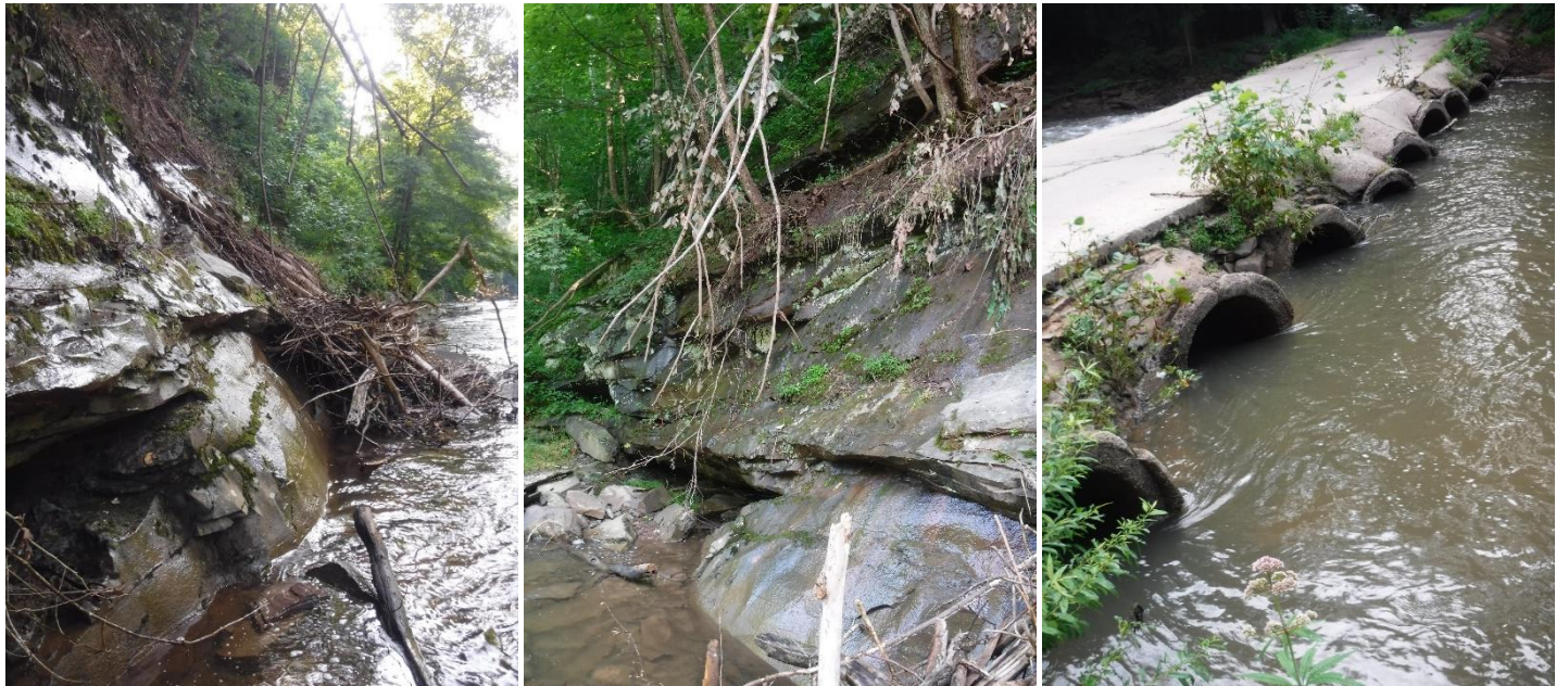
Left: The downstream washout nearest Gladwin, when wadeable (S-N view). Middle: Same spot (N-S view). Right: The "rule-of-thumb" marker for N-S hikers. Most Gladwin bridge culverts are half full or less, indicating less dangerous wading conditions at the washout.